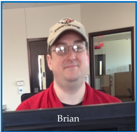
Hat Day, National Telecommuncators Week April 2015